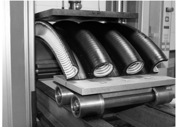
Pic. 5: testing pipe segment 79° with structured wall

The test body (79° pipe segment) is pressed together at a constant speed acc. specification of the standard ISO 9969. The measuring values of force and deformation has to be recorded continuously until a deformation corresponding to a deformation of the complete pipe of 0.03di is reached.