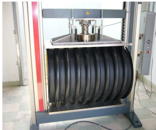
Pic.1 and 2: Ring stiffness test process acc. ISO 9969 and DIN 16961