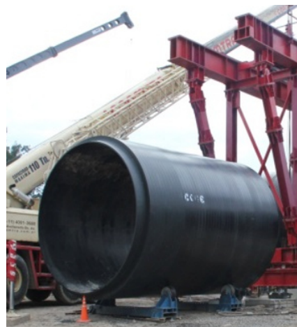
Pic.3: 16 ton polyethylene pipes DN/ID 3600 – 2.7 ton/m

Thermoplastic pipes are homogeneously manufactured and provide uniform static properties around the circumference and length. A cut pipe segment should have same characteristics if the disturbing load differences are considered. A group of large diameter pipe producers made many tests to verify the theoretical assumptions and in the meantime in the German DIN 16917 the procedure is described in detail.