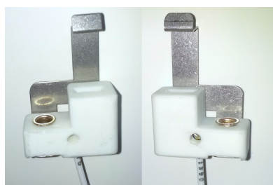
Click-system-holder (right, left)

For any further information please contact us: Plaspitec GmbH, Goethestr. 8, 57567 Daaden/Westerwald, Germany fax: +49 2741 9764-81, email: sales@plaspitec.com