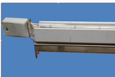
High-Performance IR-Halogen-Bulb type LRP