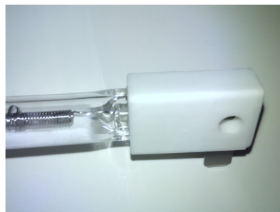
IR-Halogen bulb with Click-system